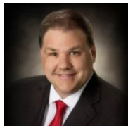
Chris Adashun Jones, Inc.

This great home has been almost completely gone through. In 2012 it had a new roof, electrical, plumbing, Kitchen, bath, first floor laundry, all floor coverings, Doors, Windows and fresh paint. Ready to move into with fenced in yard. What an inexpensive way to live. A must see!