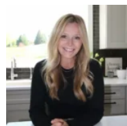
Kelly Adashun Jones, Inc.