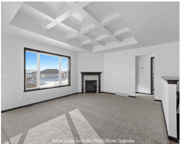
Home Similar to Photo - Photo Shows Upgrades