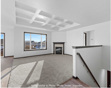
Home Similar to Photo - Photo Shows Upgrades