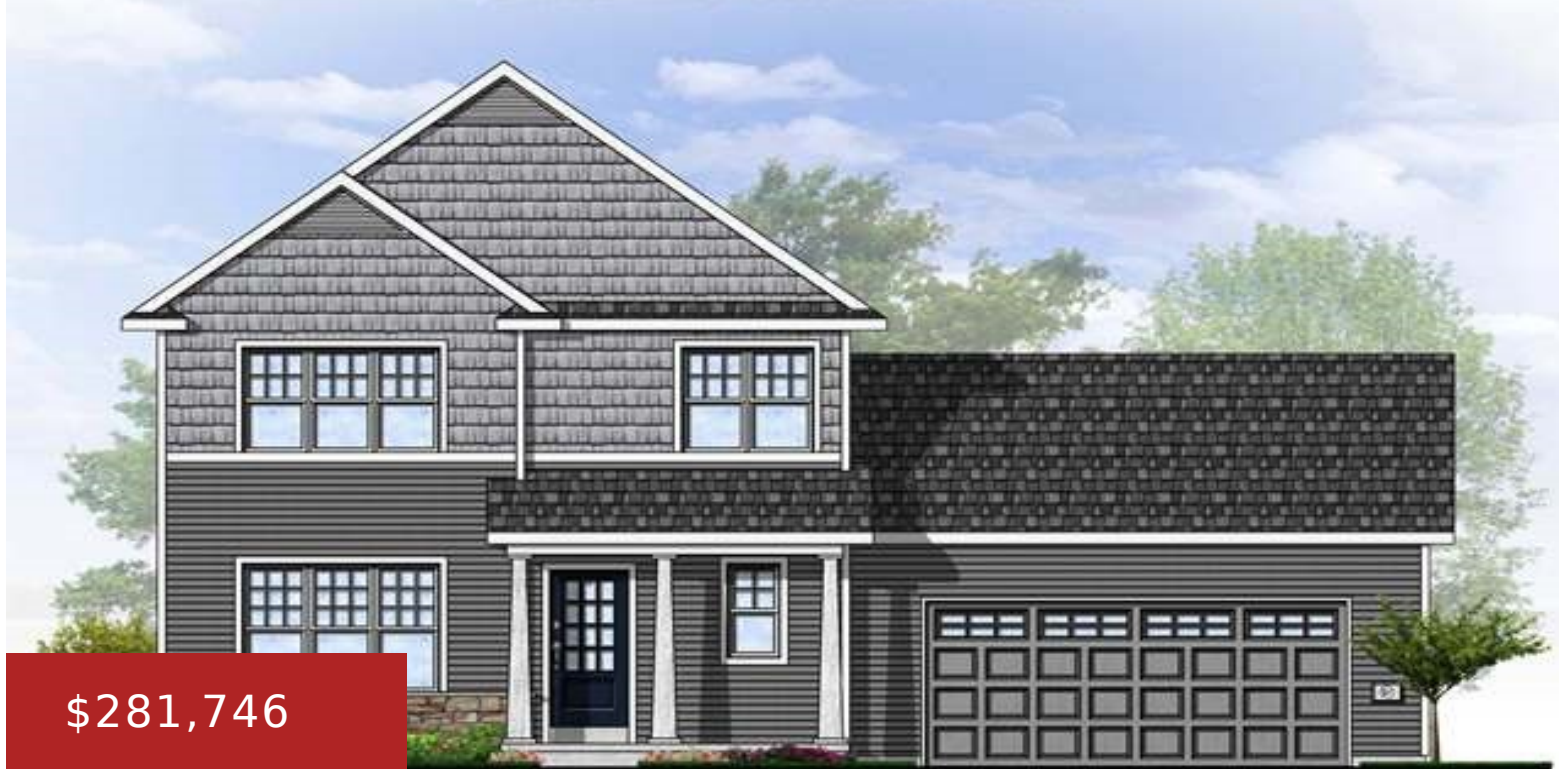
REPRESENTATIVE MODEL FOR COMPARISON

4639 Catalina Parkway, Madison, WI, 53558