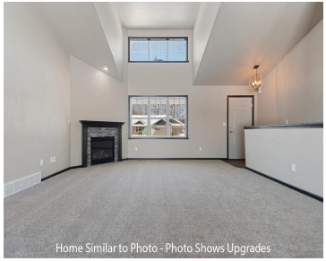
Home Similar to Photo - Photo Shows Upgrades