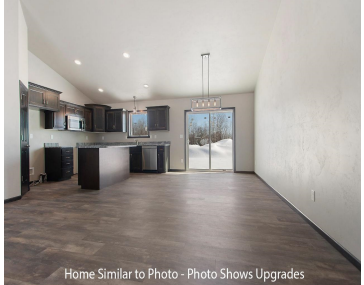
Home Similar to Photo - Photo Shows Upgrades