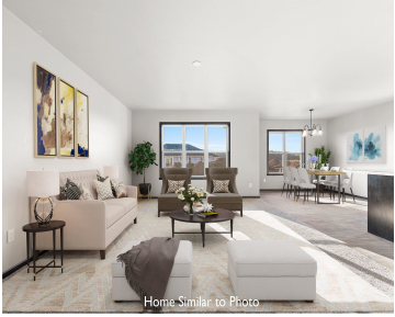
Home Similar to Photo