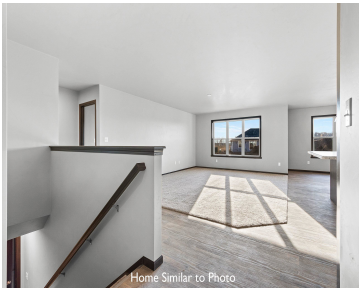
Home Similar to Photo