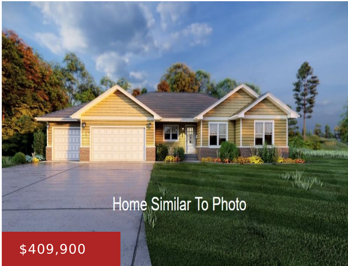
Home Similar To Photo