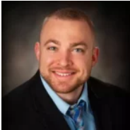
Steven Adashun Jones, Inc.