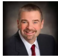
Terrance Adashun Jones, Inc.