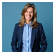
Gail Adashun Jones, Inc.

In need of efficient living at the end of a street? Look no further. Enjoy this Ranch 2 bedroom, 1 bath home with 1.5 car garage. Big backyard for entertaining and fenced in for your dog. Be ready to call this one home!