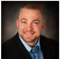
Steven Adashun Jones, Inc.