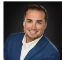
Kevin Adashun Jones, Inc.