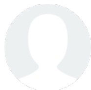
Tyson Adashun Jones, Inc.