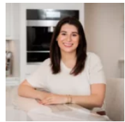
Summer Adashun Jones, Inc.