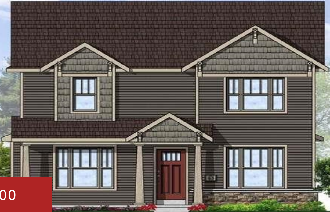
REPRESENTATIVE MODEL FOR COMPARISON

443 North Star Drive, Madison, WI, 53718