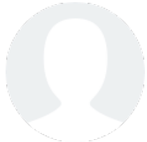
Willie Thiel Real Estate