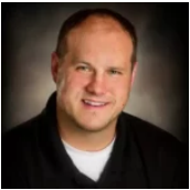
Brent Adashun Jones, Inc.