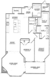
Unit 206 & 306 1,540 Sq Ft