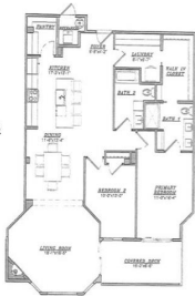
Unit 205 & 305 1563 Sq Ft