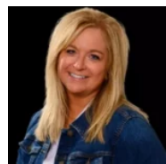
Colette Adashun Jones, Inc.

NOTHING TO DO BUT...MOVE INTO THIS SPACIOUS ALUMINUM SIDED 2 STORY CATCH. THE CELAN 2-BD HAS BEEN CAREFULLY MAINTAINED OVER THE YEARS SOME FEATURES ARE NEW PLUMBING, NEWER TEAR OFF ROOF, NEWER REPLACEMENT WINDOWS, UPDATED KITCHEN & SO MUCH MORE. AFFORDABLE PRICE FOR THIS HOME THAT MAY NOT LAST LONG!