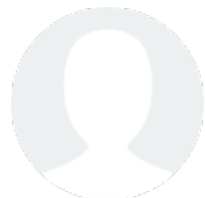
Amy Adashun Jones, Inc.