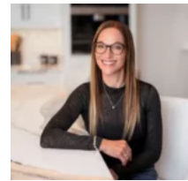
Jodi Adashun Jones, Inc.