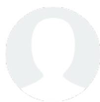
David Roberts Homes and Real Estate