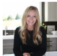
Kelly Adashun Jones, Inc.

Wonderfully maintained 3 bedroom, 1.5 bath home located in NE neighborhood. Nice size kitchen and living room. 1.5 baths. Great home at a spectacular price.