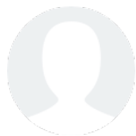
Rachel Ruesch Realty