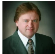
Bob Adashun Jones, Inc.