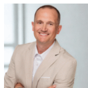
Scott Adashun Jones, Inc.