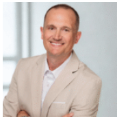
Scott Adashun Jones, Inc.