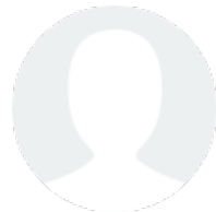
Tim Besaw Properties, Ltd