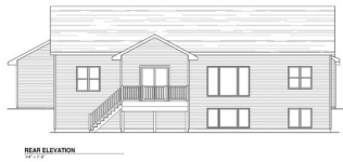
REAR ELEVATION 1/4" = 1'-0"