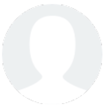
Chris Dallaire Realty