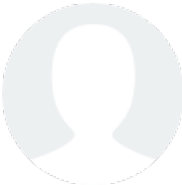
David Ruesch Realty