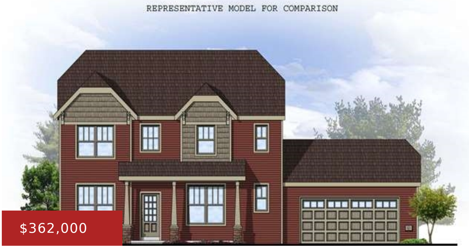
REPRESENTATIVE MODEL FOR COMPARISON