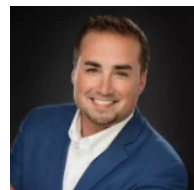
Kevin Adashun Jones, Inc.