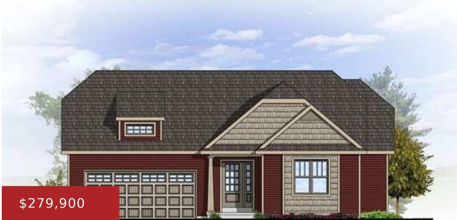
REPRESENTATIVE MODEL FOR COMPARISON

407 SUGAR MAPLE Lane, Madison, WI, 53593