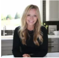
Kelly Adashun Jones, Inc.