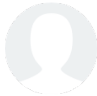
Nicole Acre Realty, Ltd.