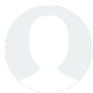
Ben Dallaire Realty