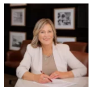
Jan Adashun Jones, Inc.