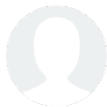
Andrew Best Built, Inc.