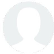
Robin First Weber, Inc.