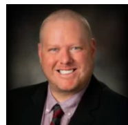
Chris Adashun Jones, Inc.