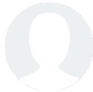
Andrew Best Built, Inc.