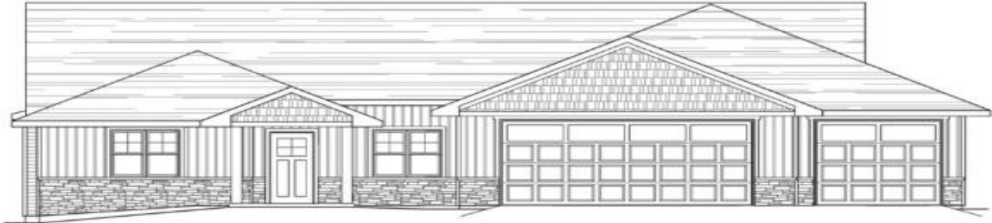
FRONT ELEVATION 1/4" = 1'-0"