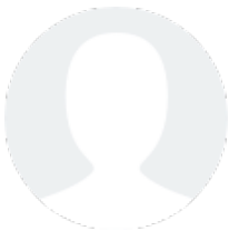
Troy Fathom Realty, LLC