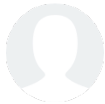
Andrew Best Built, Inc.