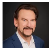
Frank Adashun Jones, Inc.

PERFECT LOCATION.... OFFERING TONS OFSTORAGE, A BEAUTIFUL USER FRIENDLYKITCHEN AND 2 STORAGE SHEDS!