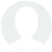
Kent Jason Gerhard & Associates Real Estate