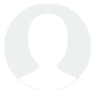
Darren Coaction Real Estate, LLC