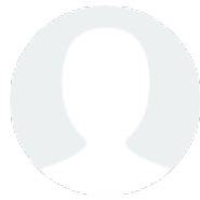
Bryan Coldwell Banker Real Estate Group