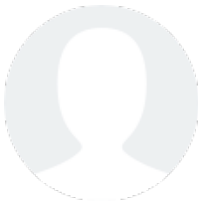
David Ruesch Realty