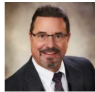
Michael Adashun Jones, Inc.