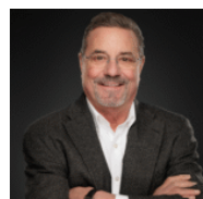
Michael Adashun Jones, Inc.