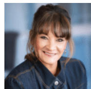
Maureen Adashun Jones, Inc.