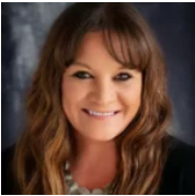
Maureen Adashun Jones, Inc.